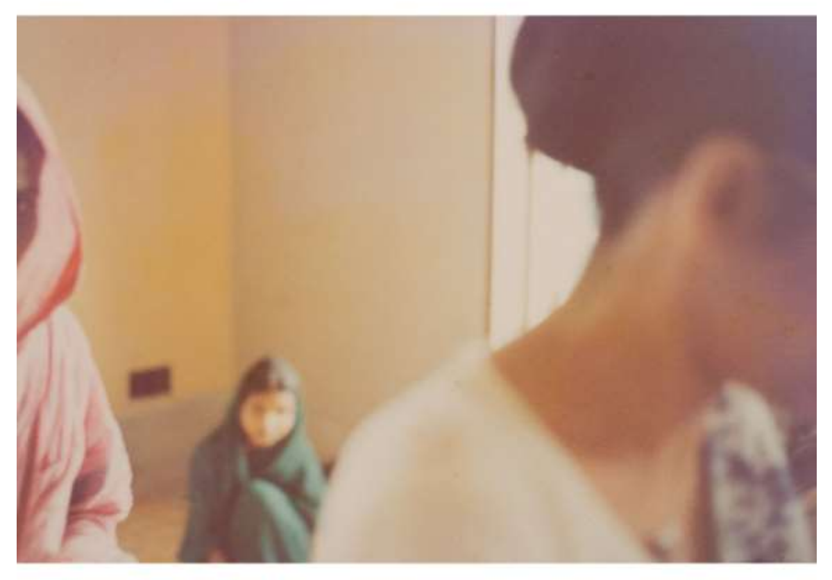
Sexual Violence, Public Memories, and the Bangladesh War of 1971